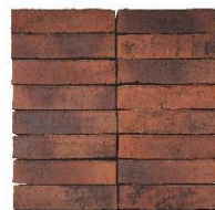
EW0466 Kobber LESS