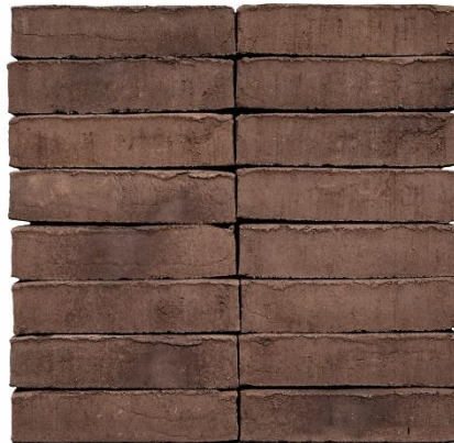
EW0477 Mahogni LESS

Product illustrations: The illustrated product below is an example of a product covered by this EPD.