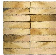
EW0491 Magma LESS