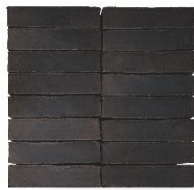
EW0449 Kul LESS

The illustrated products below are examples of products covered by this EPD.