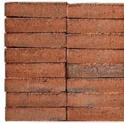
EW2260 Red coal

The illustrated products below are examples of products covered by this EPD.