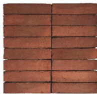
EW0465 Rød nuanceret

The illustrated products below are examples of products covered by this EPD.